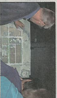
POINTE HEBERT PLAN REVEALED PAGE 5